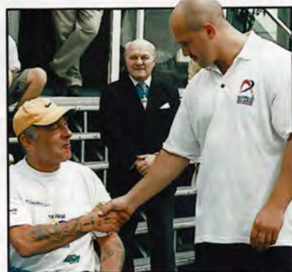
A competitor receives his prize at the Road Race