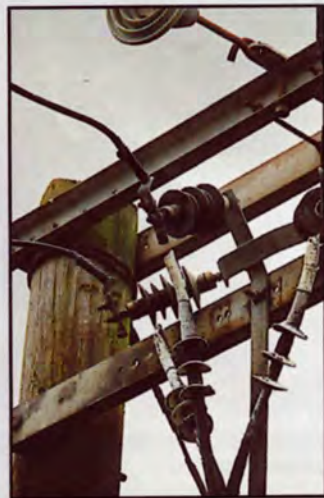
The overhead line pole where the kestrel crashed.

had survived flying through the 11Kv line.