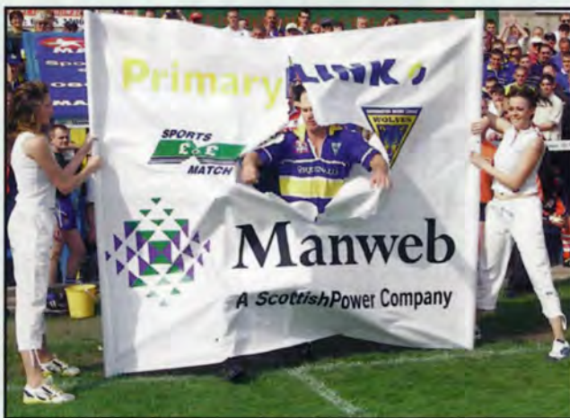
Warrington Wolves players take the field by bursting through a paper poster promoting Primary Link.