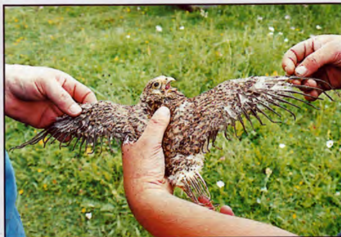
Flash the kestrel is now recovering.

"It was here that we discovered the kestrel, badly burned and perched on a branch. We threw a T-shirt over him to stop him thrashing around and put him in a