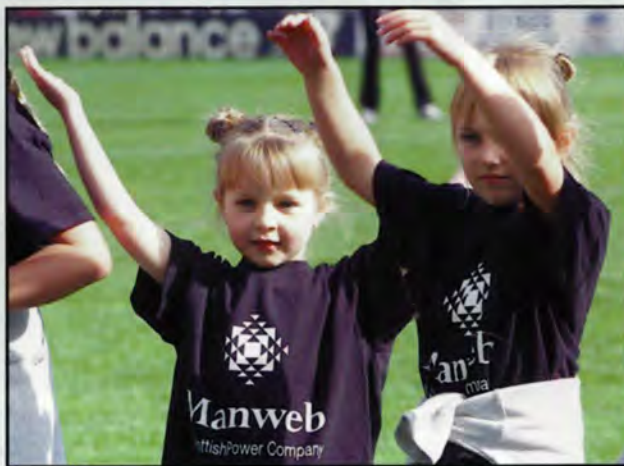
Members of a local youth and community group donned Manweb T-shirts to provide half-time entertainment.