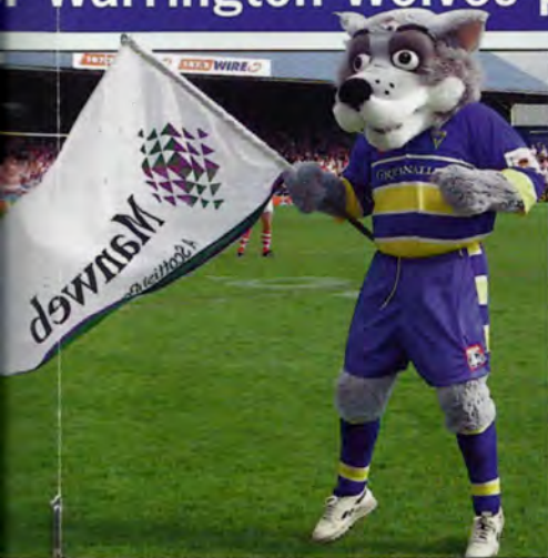
Flying the Manweb flag – Wolfie, the Warrington Wolves mascot.